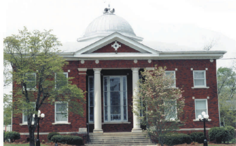
First Baptist Church of Rochelle P.O. Box 566 Rochelle, GA 31079-0566

NonProfit Organization U.S. Postage PAID Permit #8 Rochelle, GA 31079